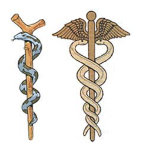
Figure 5. Serpent as an internationally popular symbol of medicine.

and medicine had been taught as a unified field of study from ancient times until Hippocrates separated Greek medicine from superstitions, magic and religion. He founded the Coan school at Cos around 430 BC (27). Hippocrates, for the first time, supported the rationality of the etiology of disease – prognosis and treatment should be based on scientific observations and on the study of human body. He believed that illness had a physical and rational explanation. He was also the first physician who believed that thoughts, ideas and feelings come from the brain and not from the heart, contrary to the belief of many others.