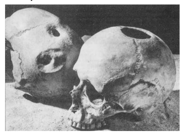
Figure 2. Surgery in the ancient time (skull trepanation).

part of the skull and to reach the brain membrane. At that time, trepanation was performed for heavy head injuries.