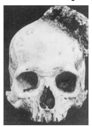
Figure 3. Cancerous growth on the head of a person from prehistoric times.

The Ebers Papyrus from around 1550 BC provides the earliest possible documentation of ancient awareness of tumors. The Kahun Gyneacological Papyrus treats women's complaints (19,20). Figure 3 shows cancerous growth in the head of a dead man. It undoubtedly shows the presence of cancer in the prehistoric times. Other remaining skulls show numerous inventive surgical procedures of the ancient surgeons.