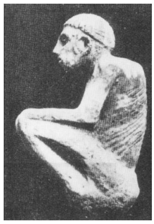
Figure 1. Mummy with spinal contracture.

A famous medical school was established in old Alexandria during the third century BC (18). The most important Alexandrian physicians were Herophilus and Erasistratus. Anatomy was particularly advanced due to the possibility of dissecting human body. Figure 1 indicates that the ancient Egyptians often suffered from osteoarthrosis.