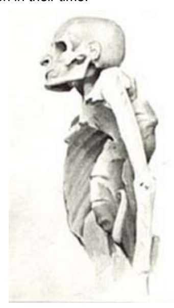
Figure 6. Clay sculpture from the earliest time with typical signs of spinal tuberculosis.

The first Renaissance doctor to effect a cure with drugs was Theophrast von Hohenheim ("Paracelsus", 1493/94-1541). He was a famous Swiss physician, alchemist, philosopher and theologist, and is today celebrated as the first modern medical scientist (73,74). Paracelsus believed a human being to have two bodies: a visible body that belongs to the earth and an invisible body belonging to heaven. Paracelsus described his view of "lunatici" (75) that man is influenced by three lights and according to this, man consists of the body, the soul and the spirit. Concerning the therapy of "lunatici," Paracelsus wrote a book on occupational diseases, which identified diseases of miners, which he attributed to vapors from the metals. Georgius Agricola also described occupational diseases of miners and metal workers. Andreas Vesalius of Brussels (1514-1564) was an anatomist, physician, and is often referred to as the founder of modern human anatomy. In 1543, he published one of the most influential books on human anatomy, De humani corporis fabrica, with a beautiful exposition of human anatomy. Figure 6 shows a man suffering from spinal tuberculosis indicating that ancient people were affected by this condition in their time.